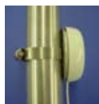
Pole/Wall Mount Option

Mobile Mark's 2.4 GHz Patch Antennas are perfect for Wireless LAN systems, as well as other applications in the ISM band. They have features that make them invaluable, solving many of the problems normally associated with 2.4 GHz patch designs.