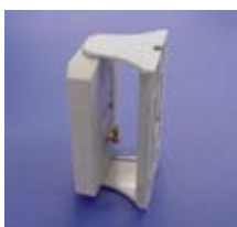
P8S-2400S side view