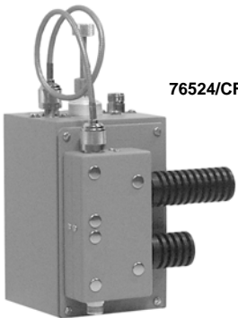
76424/CFD & 76524/CFD