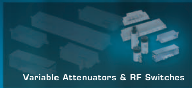
Variable Attenuators & RF Switches